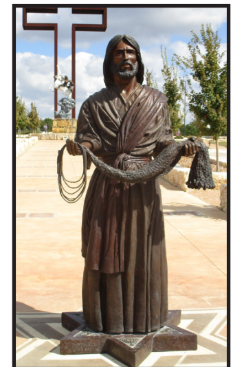
"Fisher Of Men" ® Matthew 4:18 3'6" x 3'6" x 7' (700 lbs)