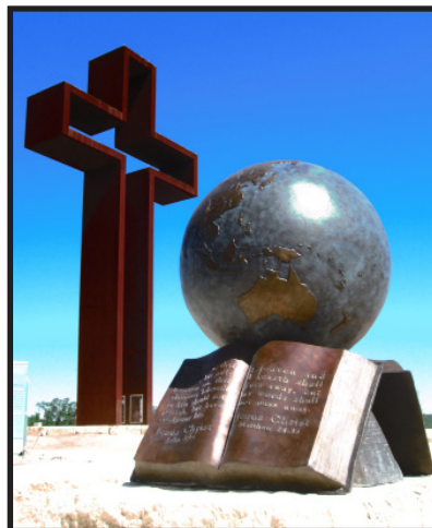
"The Great Commission" ® Matthew 28:19 5' x 4' x 6' (600 lbs)