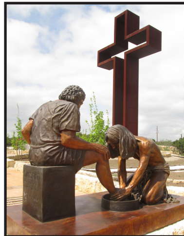
"Divine Servant" ® John 13:1 3'6" x 6'6" x 5' (1,200 lbs)