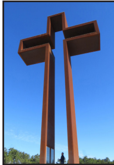
"The Empty Cross" ™ Hebrews 12:2 10' x 40' x 77' (70 tons)