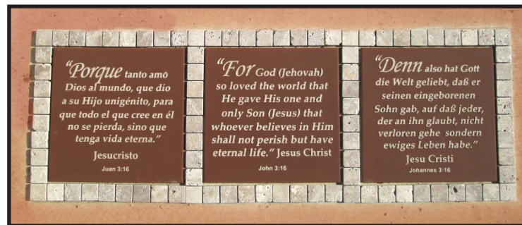
77 Bible Verses Set in precise order 16" x 16" in 3 languages