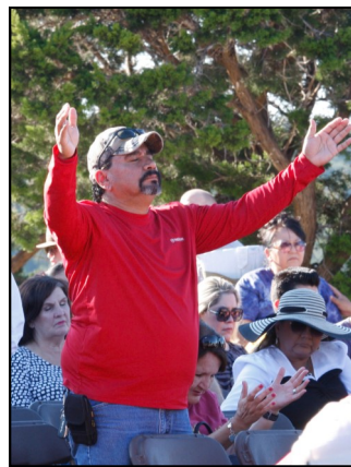
Praising the LORD

Let me wish you a Happy Thanksgiving, and a Blessed and Merry Christmas!