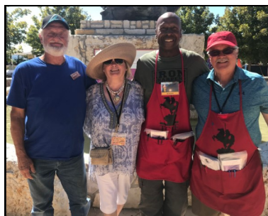
Fellowship at "The Empty Cross"