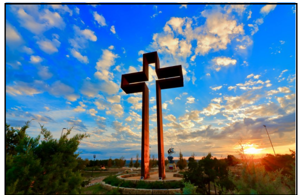
Sunset at “The Empty Cross”

Each comment individually beautiful, but strikingly similar as to what they describe; the Presence of God.