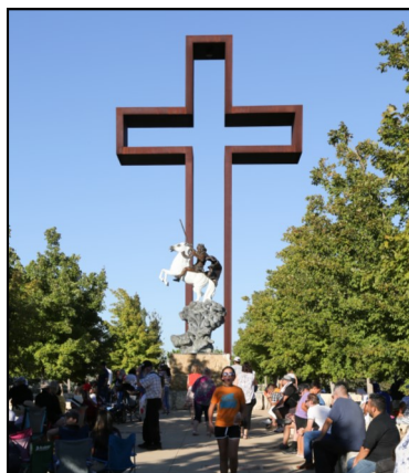
Under "The Empty Cross" during Worship