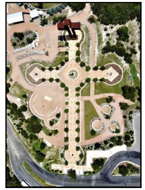
Prototype Kerrville Garden

on IH-10. The transcontinental highway that runs from California to Florida.