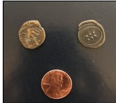
The Mite, (front and back), in comparison to a penny

It is the heart of the giver that God sees. So THANKS to that young person (and to all our Donors), God knows your heart!