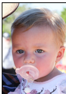
Never too young for good Worship!