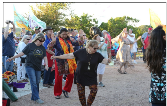
Dancing like King David

children celebrate Him, such as David dancing before The LORD with all his might (Samuel 6:14).