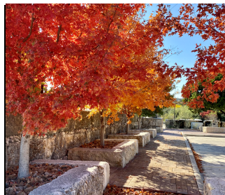
Fall at "The Empty Cross"