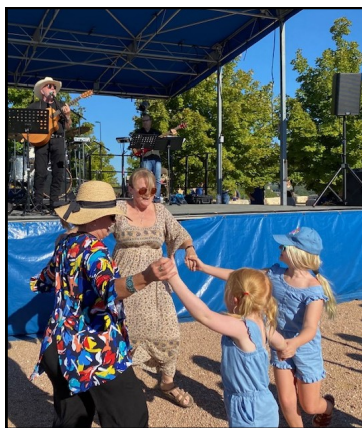
Dancing with Joy Before the LORD