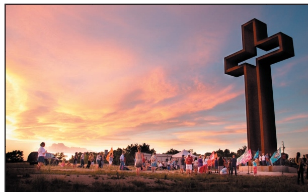
144 people came from across Texas on 7/19/12 to celebrate the opening of the front entrance.

First Monday of each month, 7:30 pm: Music and Ministry: live praise/worship music