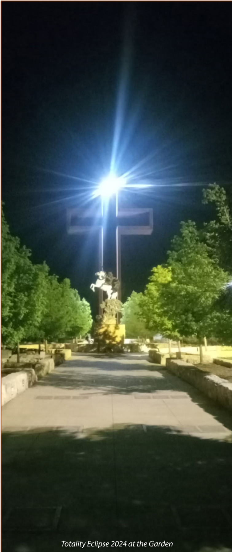
Totality Eclipse 2024 at the Garden

What the LORD is showing me is actually a two-fold message. First, He is saying I am giving you time to get your heart right with Me. Repent from following worldly or fleshly desires that keep you in a pattern of self-sabotage and destruction. Those desires and behaviors are separating you from your first love, Jesus Christ. Repent for going after other religions where there is no life! John 14:6 says, Jesus is THE WAY, THE TRUTH, AND THE LIFE. No one comes to the Father except through Me."