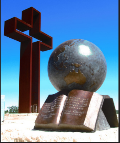
"The Great Commission" ® Matthew 28:19 5' x 4' x 6' (600 lbs)