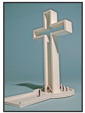
After creating rough sketches of his vision, Greiner built scale models of a 300' cross-shaped garden and a unique 77'7" cor-ten steel sculpture, which he named "The Empty Cross".