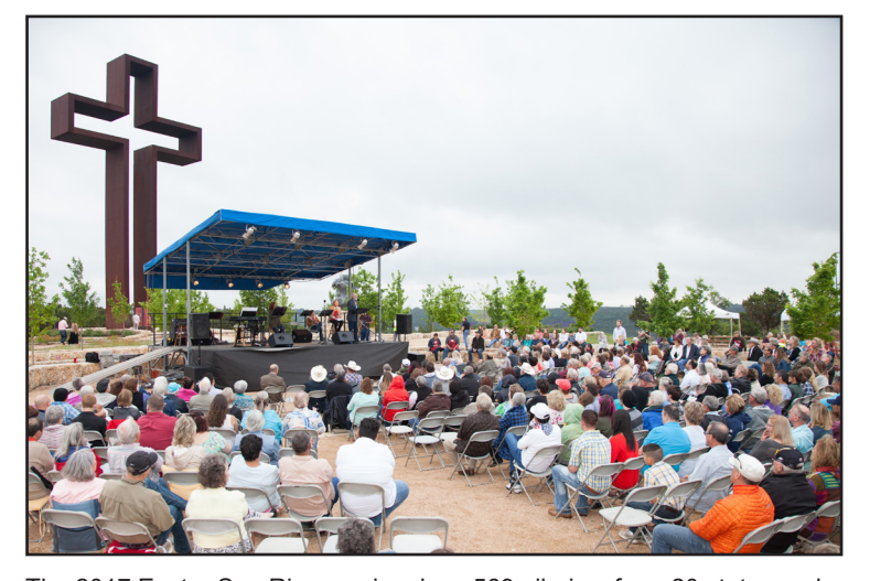
The 2017 Easter Son Rise service drew 569 pilgrims from 20 states and seven countries. The people worshipped God at the foot of the 77'7" "The Empty Cross" Corten Steel sculpture. This sculpture is considered to be the most symbolic cross sculpture in the world. It represents the Door, the Way, the Mighty Fortress, the Strong Tower, the Resurrection and the Light of the world.