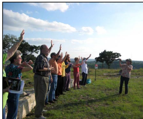
A group of TCKF prayer intercessors came together to pray for The Coming King Prayer Garden . Words of wisdom and prophecy were shared related to the 77’ 7” cross and how additional gardens will go up around the world.