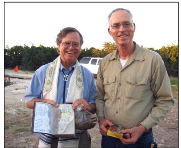
On June 17, 2010, about 40 Christians, gathered at the construction site to praise God and pray for the pouring of the concrete foundation the next day. Participants were invited to sign a Bible which was anointed with oil, water and soil from Israel.