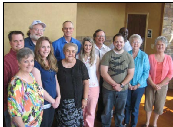
2010 Board of Trustees.