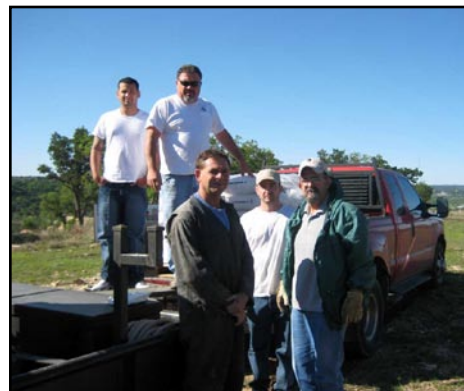
Volunteers from Living Waters Assembly of God church in Kerrville took turns sandblasting the cortin steel cross to release its red/brown patina.