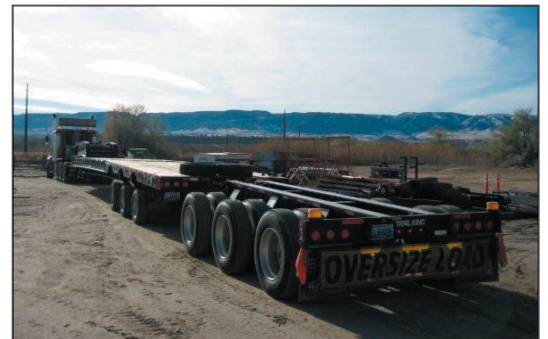
This photo shows the length of the special trailer that hauled the bottom section of "The Empty Cross" , prior to it being loaded.