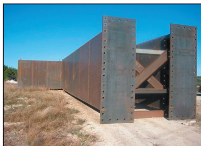
" The Empty Cross "™ is a sculpture by Christian Artist, Max Greiner, Jr. The copyrighted composition communicates the Resurrection. Its hollow design allows light to pass through, symbolizing the "Light of the World." The openness communicates all are welcome at the foot of the Cross.

A sign has been affixed to the foot of the cross until it can be erected, showing the location of the giant cross in the Sculpture Prayer Garden .