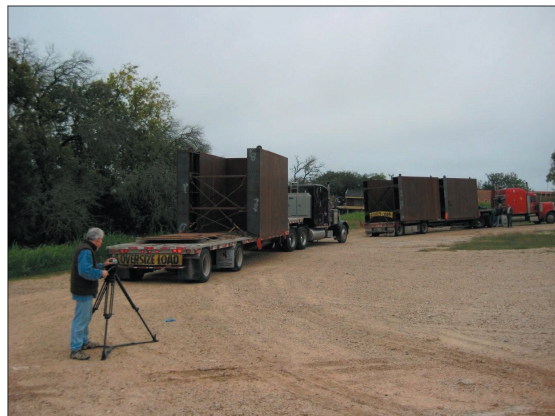
Three special trucks brought the massive cross into the Sculpture Prayer Garden via the Mesa Vista Ln. back entrance.

In 2006, atheists joined with a few other local residents, in a relentless campaign to stop the cross and evangelical Garden. The Kerrville City Council and Planning Department were besieged with calls and letters from a few people demanding that the cross be stopped. The newspapers and San Antonio TV stations even received deceptive News Releases, created by an atheist, designed to turn public opinion against the Christ-honoring Garden. Negative editorials, based on this false information were published. "Letters to the Editor" , filled with half-truths and outright lies, were published in the local newspapers. The result was more confusion regarding the purpose and nature of the Christ-honoring project.