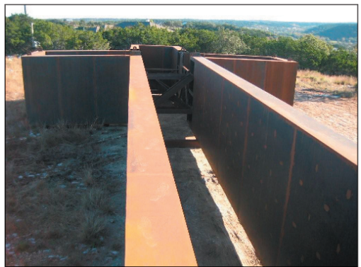
The 77'7" Cortin steel 69.4 ton cross arrived in the Kerrville Sculpture Prayer Garden on October 29, 2009, without fanfare, due to threats by atheists to destroy and vandalize the cross.

The battle intensified on December 8, 2008, when a lawsuit was filed in the 216 th District Court of Texas, in an effort to permanently stop the erection of the seven-story cross sculpture on its foundation. At the time, the $100,000 concrete foundation was half completed. The Trial has been tentatively scheduled for February 2010, since two Mediation sessions, requested by TCKF so far have failed to resolve the matter.