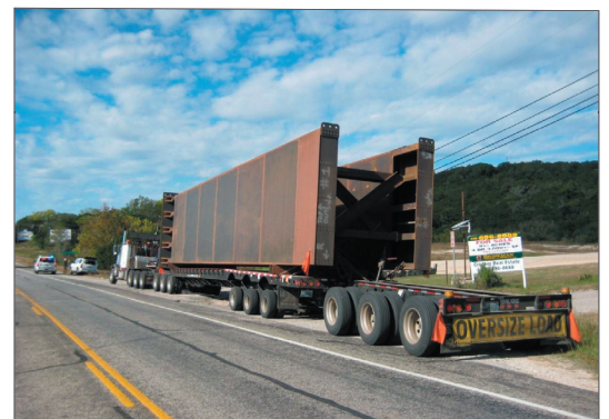
Thousands of people witnessed the giant cross being transported to the Kerrville Sculpture Prayer Garden . However, few realized it was a cross since it was transported in four pieces.