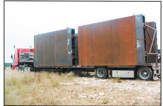
The 138,800 lb. 77'7" Cor-tin steel cross was transported on three special trucks, 1,155 miles through Wyoming, Colorado, Oklahoma and Texas.