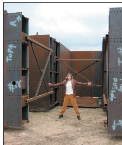
"The Empty Cross," has many spiritual dimensions. The sides of the hollow 77'7" cross are 10' wide. The center space is 7' wide. The cross arm is 40' in length.