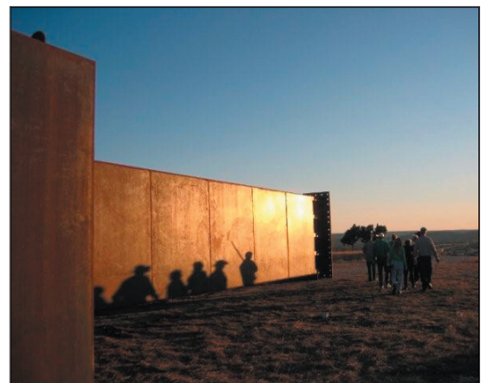
TCKF Trustees met on November 3, 2009 to pray and discuss the lawsuit filed against the non-profit ministry. Following the meeting they went to the site of " The Empty Cross " to pray and anoint the Cross for the work of God's Kingdom. Those present walked around the cross 8 times praying and proclaiming God's Victory!