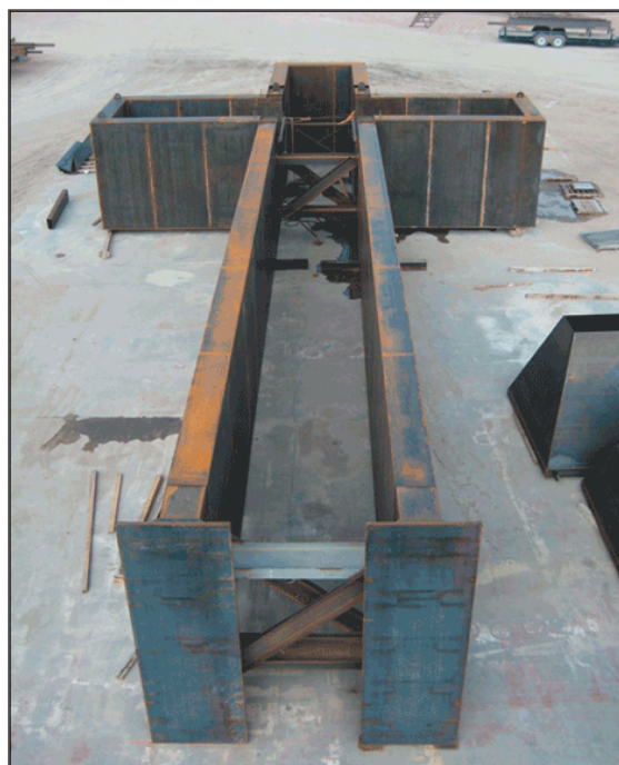
"The Empty Cross" sculpture was constructed by Eagle Bronze Foundry , owned by Christians, Monte and Beverly Paddleford. The construction process in Wyoming took three years.

When completed, the sculpture park will feature the Gospel in multiple languages, engraved on Scripture Tiles , which will be placed every 12', in the 300' long cross-shaped garden, at the very top of the mountain. The symbolic cross sculpture will be erected at the end of this 100 yard long, evangelical, flower-lined garden.