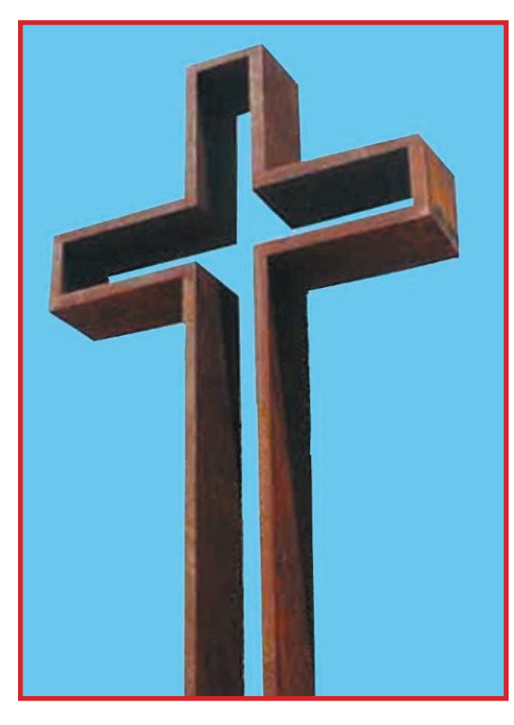
"The Empty Cross" measures 77'7" tall, with a 40' wide cross arm and a 7' wide center space. It weighs 70 tons and is made of red/brown Cor-tin steel, which symbolizes the shed blood of Christ.

The Bible says that God brings good out of the bad for those who are called according to His purposes. As a direct result of the current legal battle, the Garden, the cross and Jesus Christ are receiving hundreds of thousands of dollars worth of free publicity nationwide!