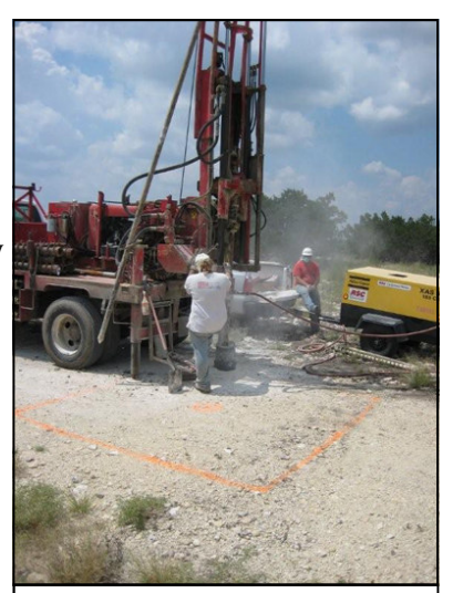
Engineers test the rock. Of course, we know the rock is solid under us.

On Friday, August 31, 2007, PSI , a structural engineering firm from San Antonio, drilled a "core sample" which confirmed what we already believed was true. Indeed, God has placed solid rock at the exact spot where the giant cross will be raised! While soil material is all over 95% of the 23 acres site, God knew we would need a solid formation of limestone rock, as the foundation for the heavy metal cross, at the top of the hill. Photos are included here, which show the "core sample" being taken. Notice that the 77' 7" cross will be about three times the height of the drilling rig. The 10' x 10' cross "foot print" can be seen in one photo, marked out in orange paint on the ground.