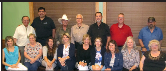
2017 TCKF Trustees & Staff

TCKF is a 501c3 non-profit foundation and all donations are tax deductible in the USA.