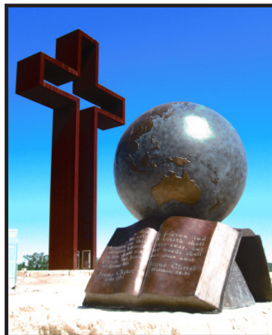
"The Great Commission" ® Matthew 28:19 5' x 4' x 6' (600 lbs)